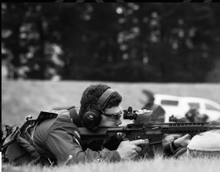
New Zealand Defence Force KiwiSaver Scheme