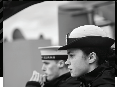
Defence Force Superannuation Scheme