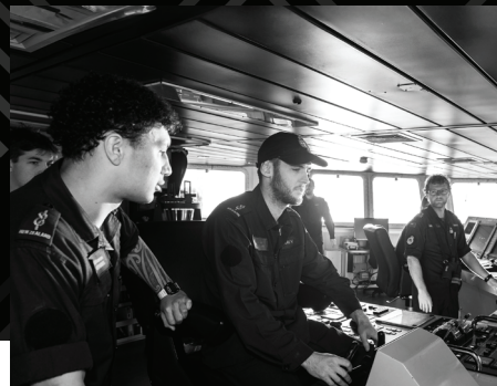
New Zealand Defence Force FlexiSaver Scheme